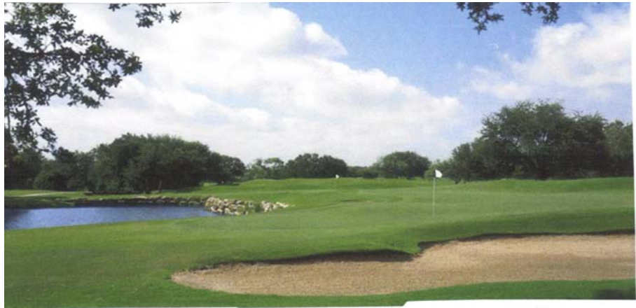
The Tranquil Threat of Lakes and Ponds